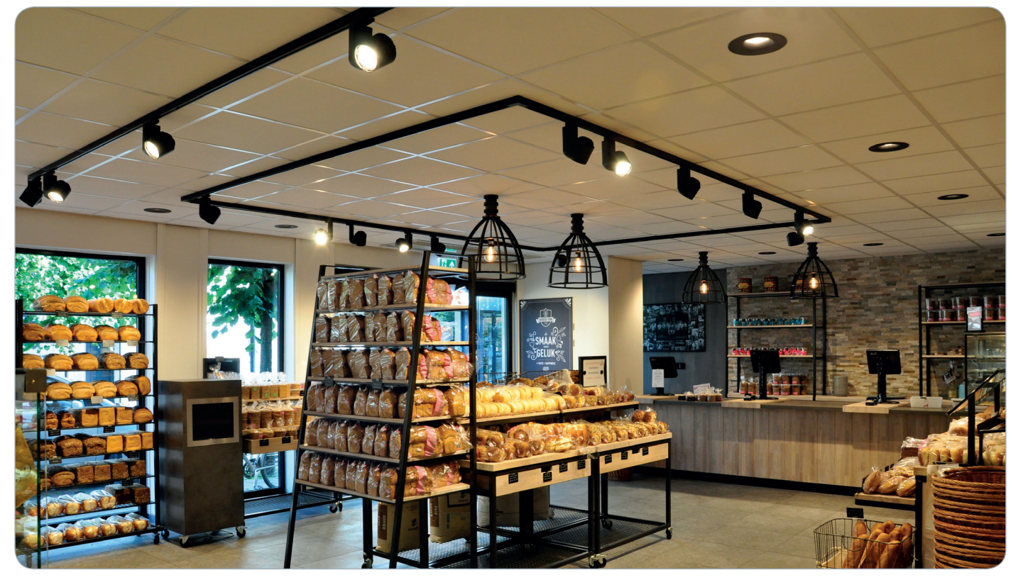
Bakery Geert Vonk, The Netherlands